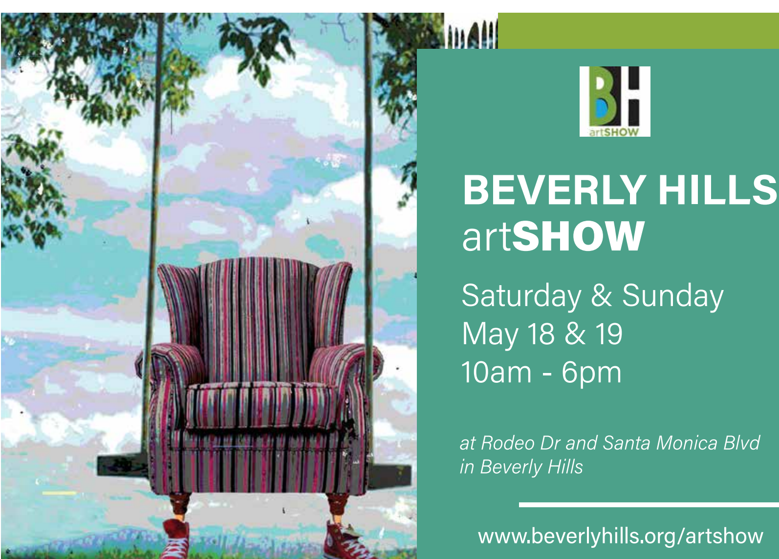
Page 2 • Beverly Hills Weekly