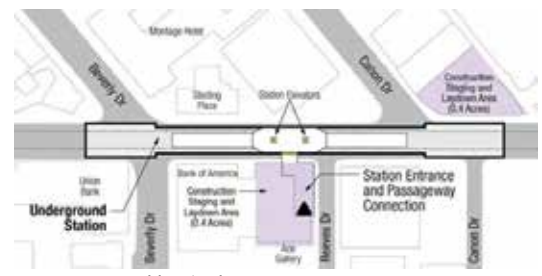
Wilshire/Rodeo Station Construction Area

For more information on the Metro construction, please call 213.922.6934 or email purplelineext@metro.ne