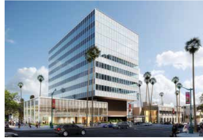
A view of the property from Wilshire

A landmark modern office building at Wilshire Boulevard and Doheny Drive will be transformed into a luxury hotel,