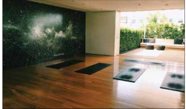
Alo Yoga's studio

Alo Yoga, located on 370 North Canon Drive, provides its customers with a community-based retail experience by incor-