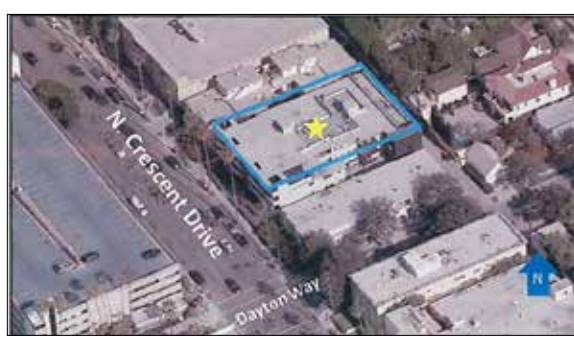
310 North Crescent Drive

The permit was approved by the planning commission on December 10, 2015 and was valid for an initial period of three