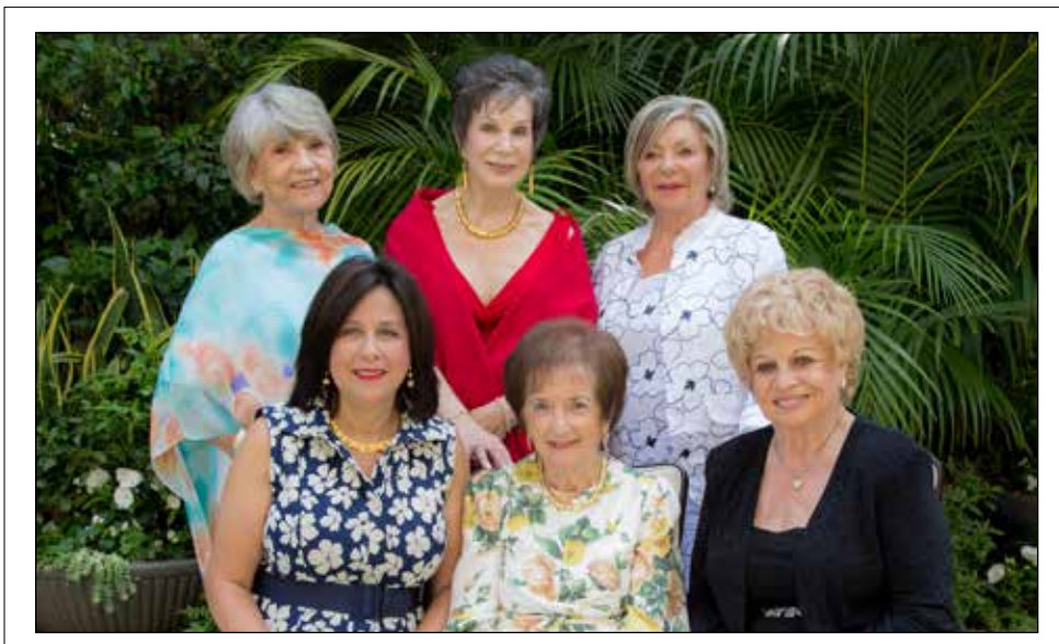
Tree of Life Luncheon held at Four Seasons

On Thursday, August 8, The Associates, a women's auxiliary support group of the Los Angeles Jewish Home, held its 89th Tree of Life Luncheon at The Four Seasons Hotel Los Angeles.