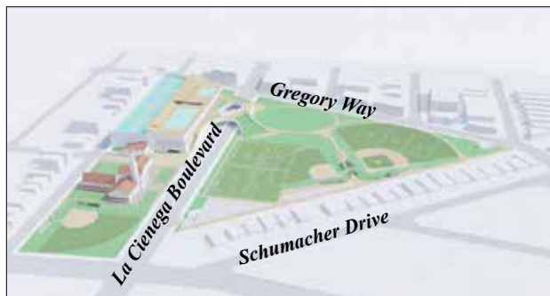
La Cienega Park Plan

At the fifth level of the renovated recre-