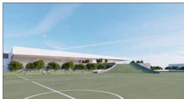
Proposed Conceptual Design for La Cienega Park and Recreation Complex fields, pedestrian bridge and recreation complex

Staff sought feedback and a recommendation from the Commission on the proposed concept design and preliminary