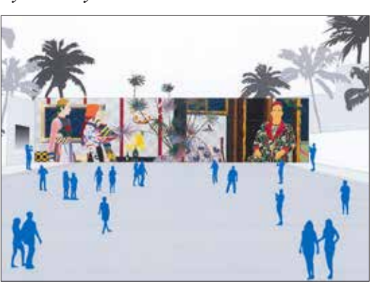
"Utopia" proposed design by Matsuyama