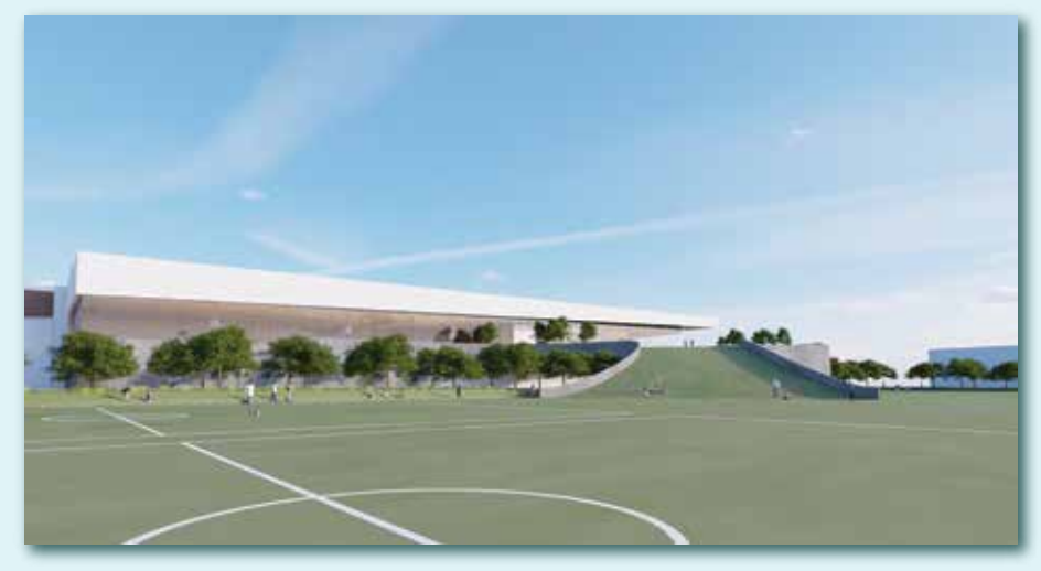
Proposed conceptual design of La Cienega Park and Recreation Complex

After hearing all your ideas and receiving your feedback about La Cienega Park and its buildings, fields and programming, you can now see how your input was put into a conceptual design. Architects will present renderings, construction phasing options and preliminary construction costs.