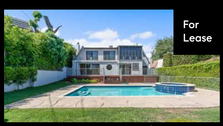
1414 Club View Dr | 3 BD | 5 BA | $12,900/mo