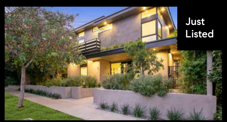
9021 Rangely Ave | 4 BD | 6 BA | $5,250,000