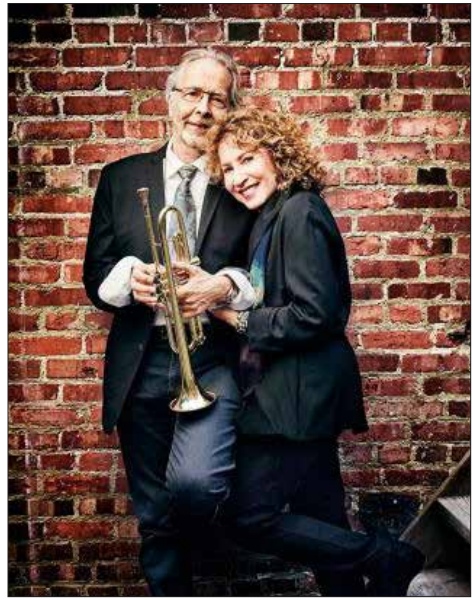
Herb Alpert and Lani Hall lion records.

Trumpeter and composer Alpert and his wife, Hall, two-time Grammy award-winning vocalist and producer are described as a "true music power couple," by "Opera Wire" and have collectively earned five number one hits, nine Grammy awards, fifteen Gold albums, fourteen Platinum albums, and have sold more than 72 mil-