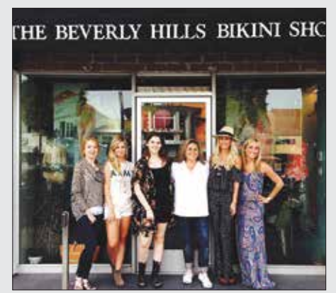
The Beverly Hills Bikini Shop

She said she had to furlough all of her employees.