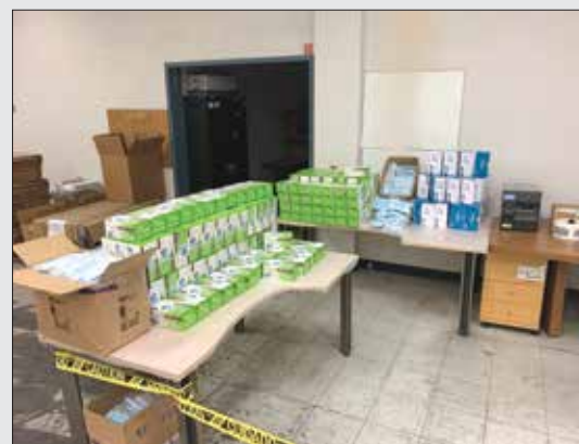
Masks to be donated to hospitals from MGA Entertainment.

We are 100% compliant. I am happy to report that we had an inspection from the Health department in Ohio where they said we have gone above and beyond the regulations. They took some of the things that we do, to recommend for other factories. The safety of our employees is our number one concern.