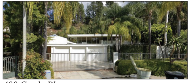
400 Castle Place

The building will be 19'-6' in order to match the height of its existing building, which was built in 1962. According to a city staff report, the home currently has a legally