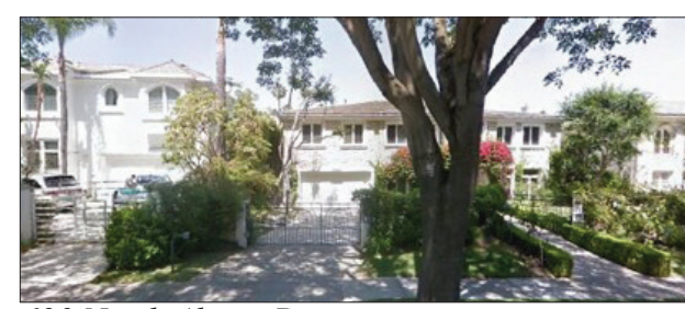
620 North Alpine Drive

The project applicant proposed the construction of a 918 square foot, two-story accessory structure with a 562 square foot basement. The maximum height is proposed to be approximately 21' - 11". Without the