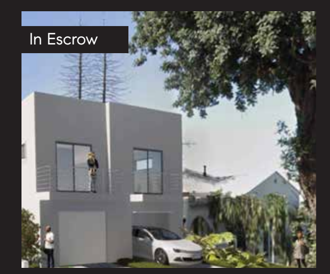
2419 S Cochran | Off Market

g opportantly lows, an induction presence internet is mended for informational purposes only, information is compiled from sources a an architect or engineer. This is not intended to solicit property already listed. The buyer is advised to independently verify the accurac even the Listing and/or Selling Agent. This is not intended as a solicitation if your property is currently listed with another DRE DISA