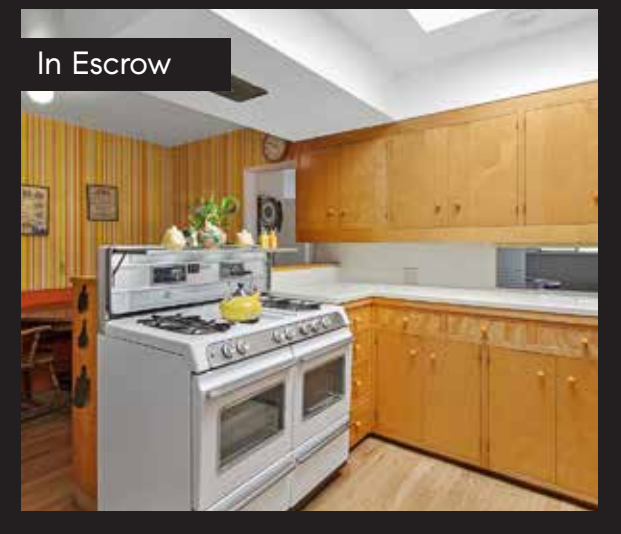
4267 Mentone Ave

g opportantly lows, an induction presence internet is mended for informational purposes only, information is compiled from sources a an architect or engineer. This is not intended to solicit property already listed. The buyer is advised to independently verify the accurac even the Listing and/or Selling Agent. This is not intended as a solicitation if your property is currently listed with another DRE DISA