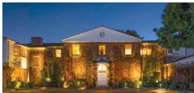
1050 Summit Drive

a HIP and a Tree Removal Permit for the home located on 1050 Summit Drive in its June 25 meeting.