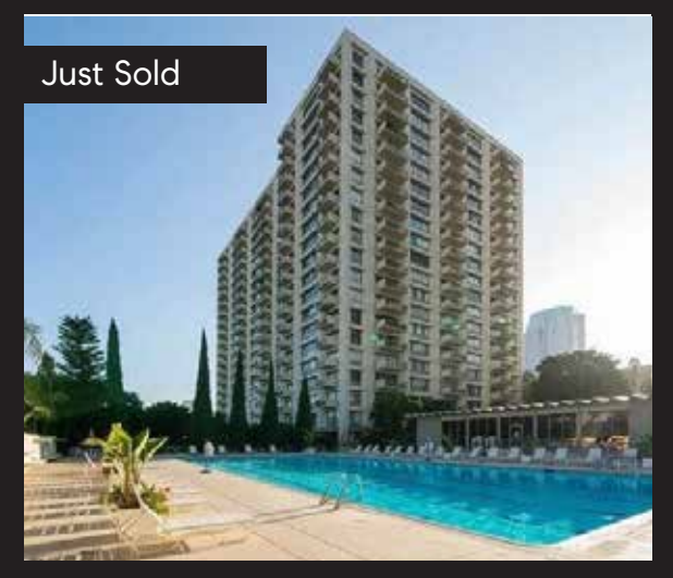
2170 Century Park East #1406

310.435.7399 mobile | jennyohomes@gmail.com | jennyohomes.com | @jennyohomes | DRE 01866951