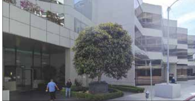
8370 Wilshire Boulevard

The agenda report states that the appli-