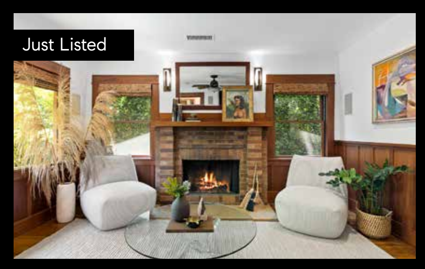
625 California Ave., Santa Monica Offered at $2,895,000