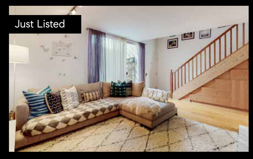
621 California Ave., Unit 3, Santa Monica Offered at $1,099,000