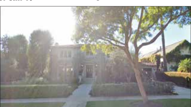
briefs cont. on page 4