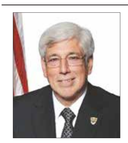
"The real question here will be answered by the voters at the ballot box. We are merely putting it on the ballot"

applying them prospectively. "I would think that it would be the right thing for the council to accept the Secretary of State and the Attorney General's very very clear opinion on what the meaning of the word prospective is,"