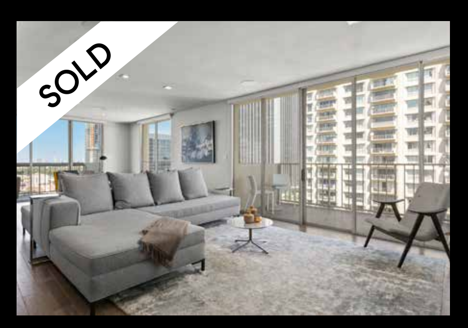
2170 Century Park East #1406 Sold for $1,300,000 Represented Seller, record breaking sale.