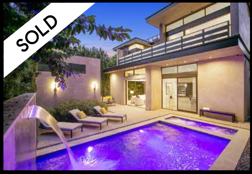
9021 Rangely Avenue | West Hollywood Sold for $4,000,000 Represented Seller