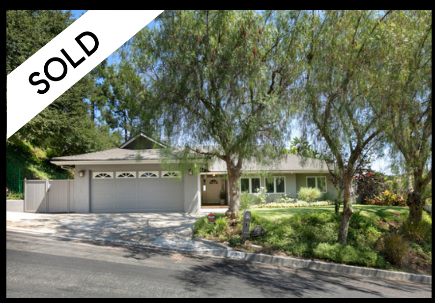
10935 Alta View | Studio City Sold for $1,900,000 Represented Buyer and got offer accepted the first day.