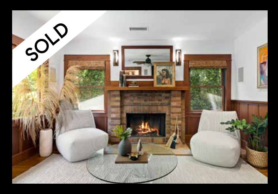
625 California Avenue | Santa Monica Sold for $2,675,000 Was previously listed with 2 other agents.