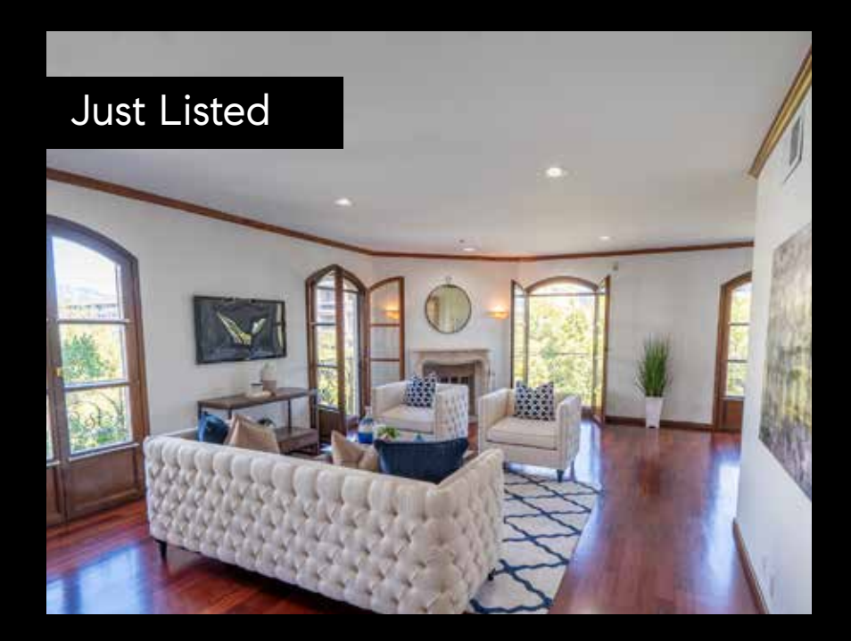
9233 Burton Way #406 | Beverly Hills