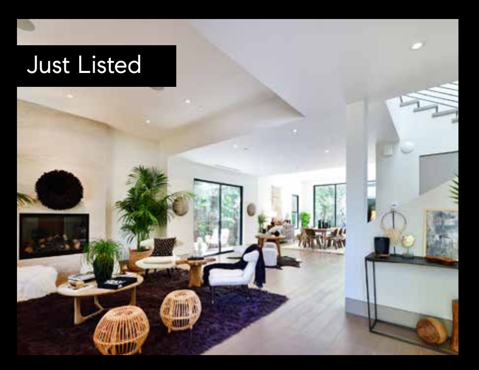
701 Huntley | West Hollywood