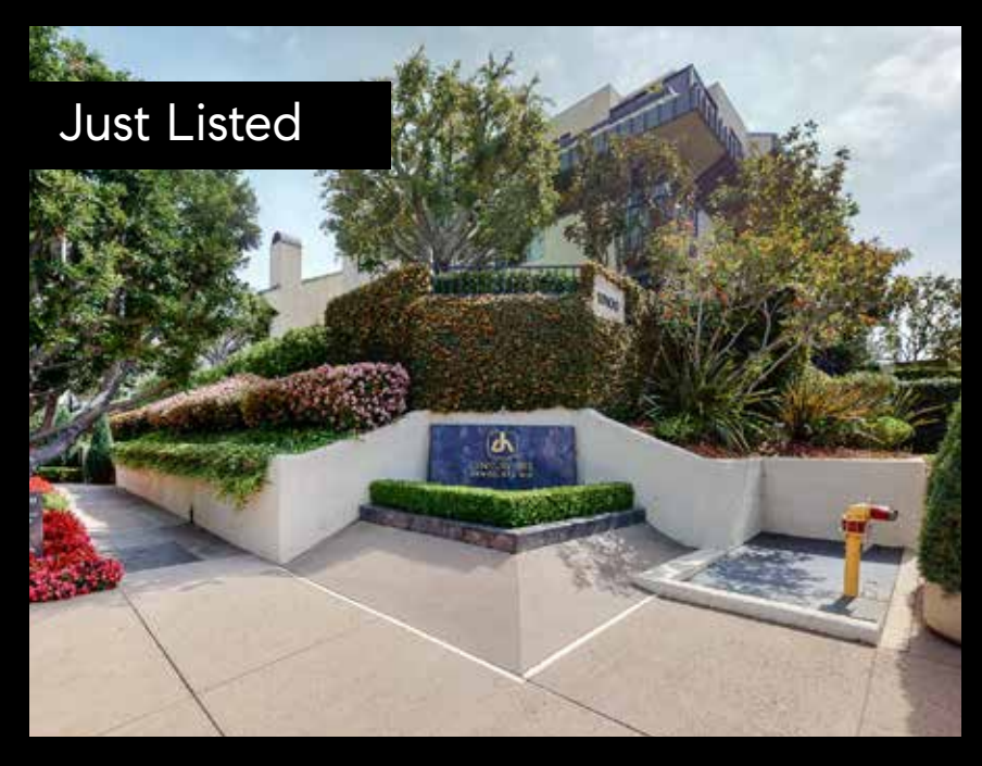
2228 Century Hill | Century City

310.435.7399 | jennyohomes@gmail.com | jennyohomes.com | @jennyohomes | DRE 01866951