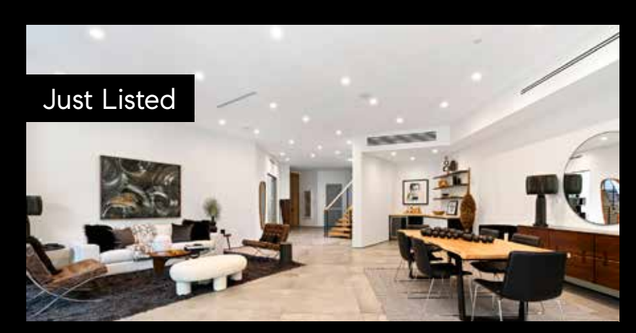
460 North Kings Road | Beverly Grove