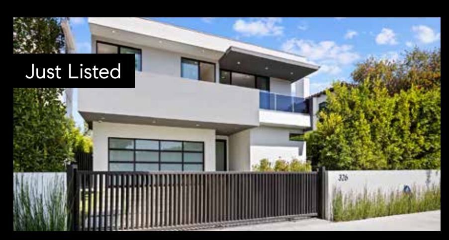
326 North Croft Avenue | Beverly Grove