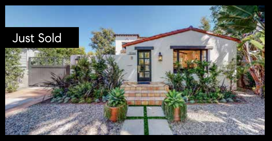
10388 Ilona Avenue | Century City