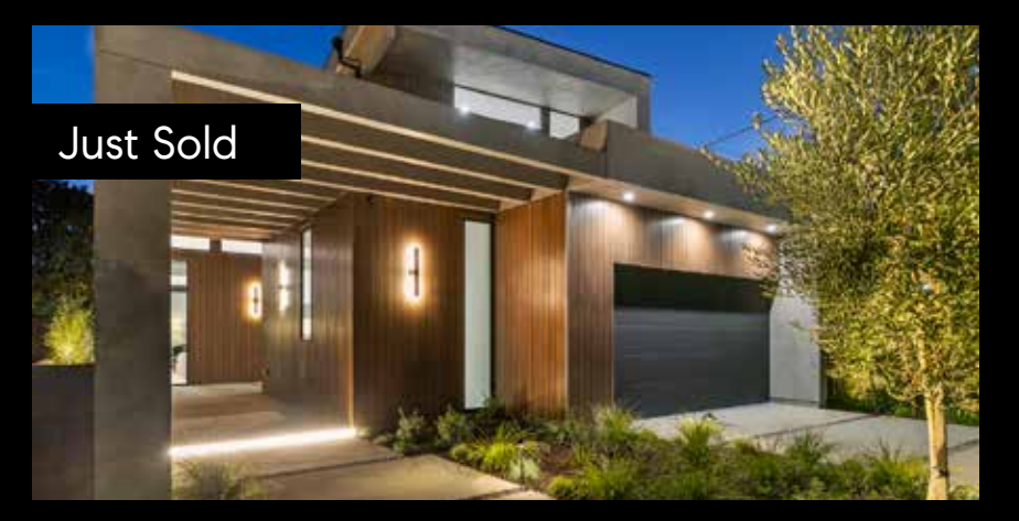
2360 Camden Avenue | West LA