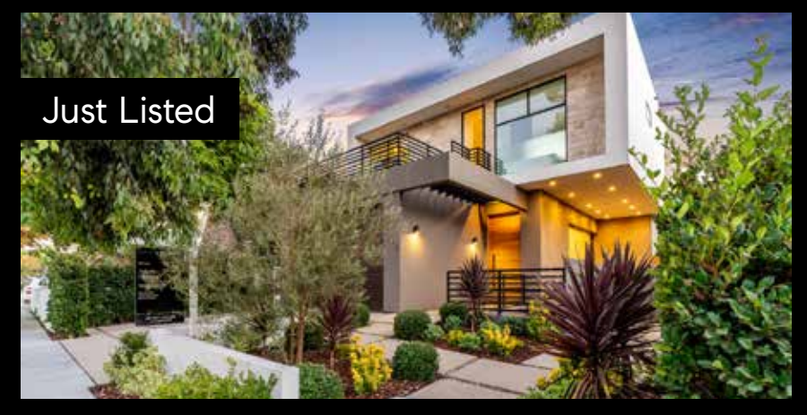
8356 West 4th Street | West Hollywood

310.435.7399 | jennyohomes@gmail.com | jennyohomes.com | @jennyohomes | DRE 01866951