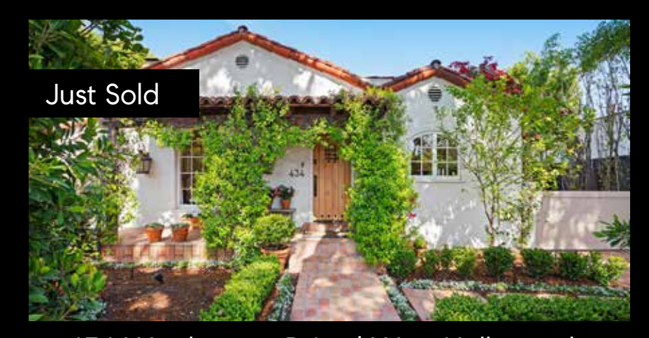
434 Westbourne Drive | West Hollywood