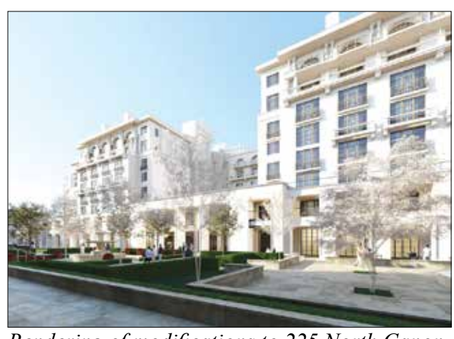
Rendering of modifications to 225 North Canon Drive

an existing deck that will be surfaced with stone/tile pavers, installing a new elevator, including a membrane roof and parapet, repainting the building an off-white color, and square openings in the exterior stucco finish, new steel black doors, windows with metal spandrels that will be painted to match the doors, limestone trim, and glass railing that will be installed on Levels 1 and 2.