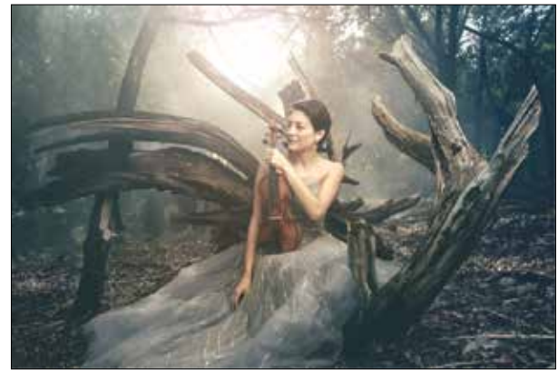
Anne Akiko Meyers

will be the first musical artist to perform indoors since the theater shutdown last year due to COVID-19. The performance will be on Oct. 2 at 7:30 p.m. and ticket prices range from $39 to $99.