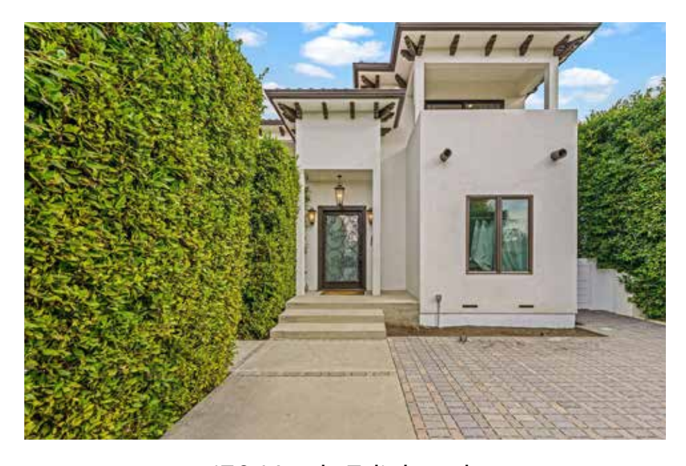
138 North Edinburgh Sold for $2,740,000 Represented Buyer