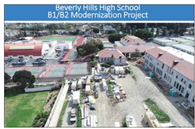
Aerial photo taken Aug. 27

The Beverly High Modernization project for buildings B1 and B2 is 95% com-