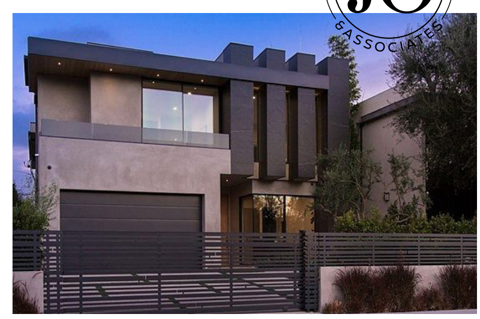
356 North Harper Sold for $4,000,000 Represented Buyer