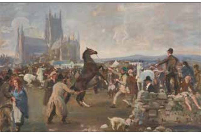
The Kilkenny Horse Fair, 1922

celebrated equestrian Impressionist artist Sir Alfred Munnings: /The Kilkenny Horse Fair /($200,000-300,000) and / Making a Polo Ground at Princemere/ ($100,000-150,000) as well as /Lark