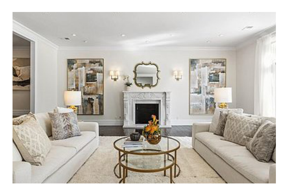
506 North Crescent Sold for $7,375,000 Represented Buyer