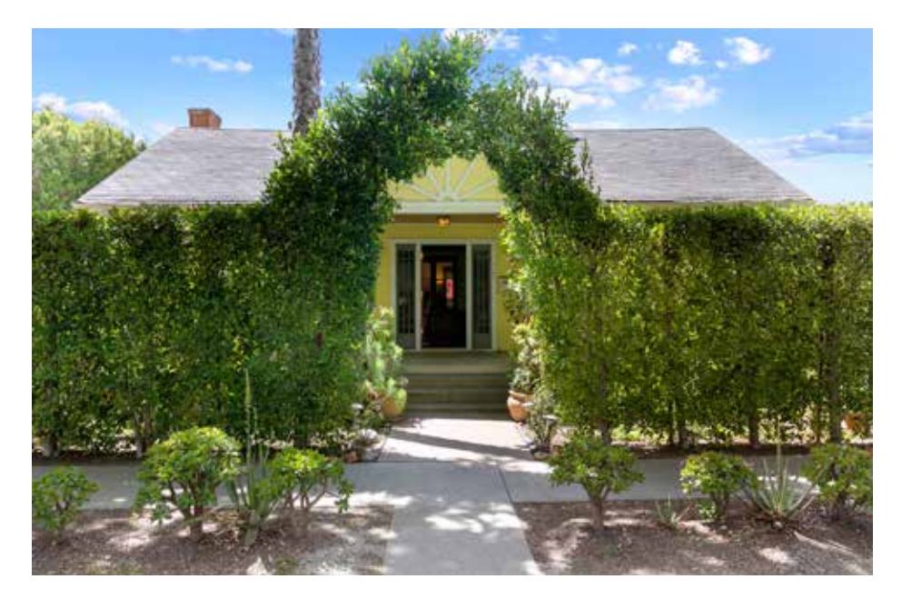
525 Westmount Sold for $2,450,000 Represented Seller