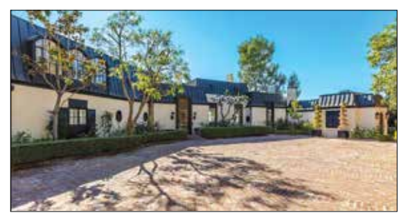
1010 Hillcrest Road

square foot single family home and was designed by John Elgin Woolf in 1959. The property combines elements of English Regency and French architecture.