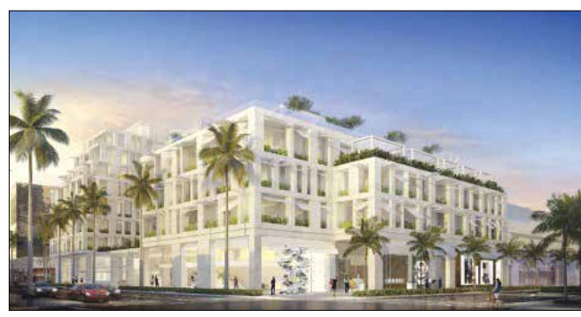
Rendition of Cheval Blanc project

The Draft EIR looked at air quality, biological resources (Bats), cultural resources, energy, geology/soils (paleontological), greenhouse gas emissions, land use and planning, noise, transportation, tribal