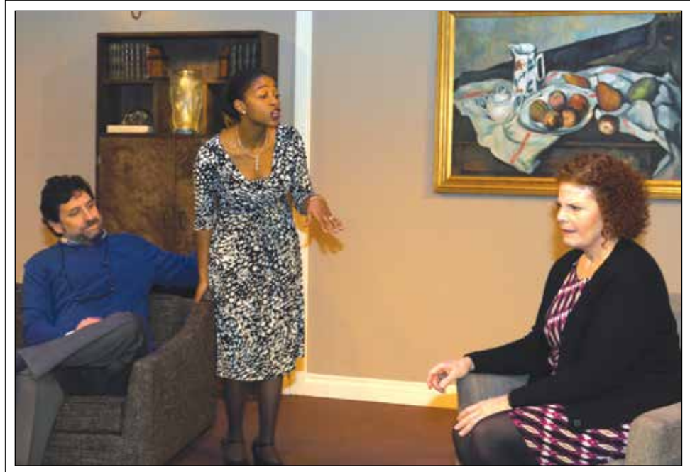
Theatre 40 Presents "Good People"

The Initiative provides that adopted local land use and zoning laws override