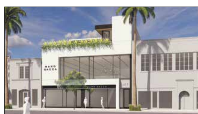
Rendition of Project

The comments made by the commission included: consider increasing the quality of finish details, for the building to increase the aesthetic; provide images of the structure from a distance to show the parking structure, as viewed from the