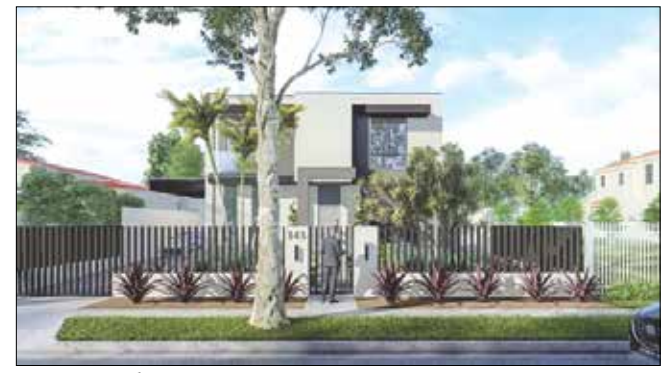
345 South Canon Drive

The proposed architectural style is identified as rectilinear contemporary design. The commission reviewed an earlier iteration of a design for a new two-story single-family home on the site in 2018 and a new design was submitted by a new