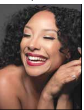
House; Library of Congress; Carnegie Hall; Kennedy Center; and more. In 2020 she marked her acting debut as Dorinda Clark in The Clark Sisters: The First Ladies of

Sheléa blends traditional pop, jazz, R&B, and soul, intended to bring a contemporary edge to classics, and a classic touch to contemporary pop standards. She has performed twice at the White