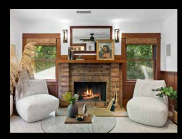
625 California Ave | Santa Monica