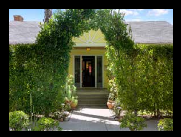
525 Westmount Dr | West Hollywood