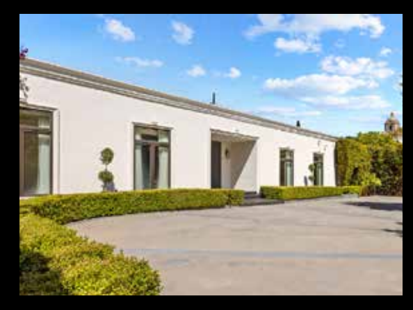
506 N Crescent Dr | Beverly Hills