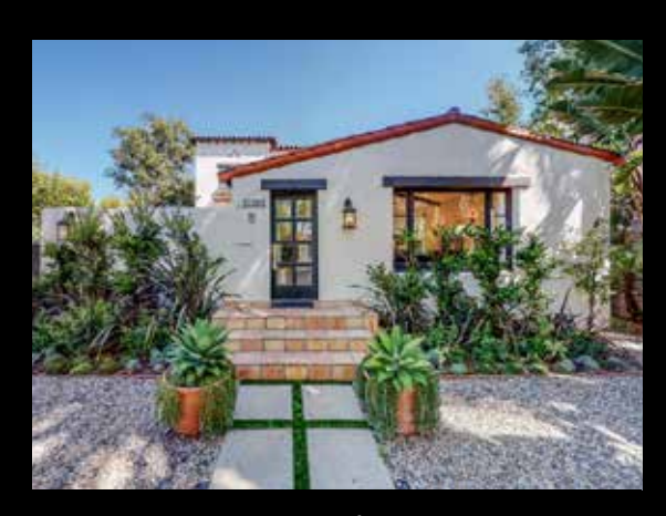
10388 Ilona Ave | Century City