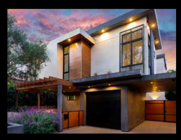
9019 Elevado | West Hollywood