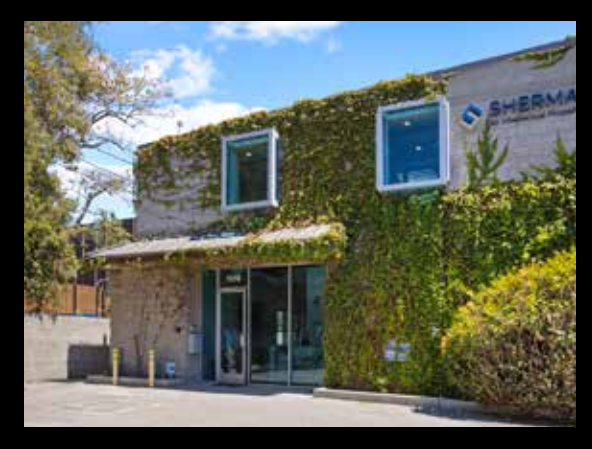
1519 26th St | Santa Monica