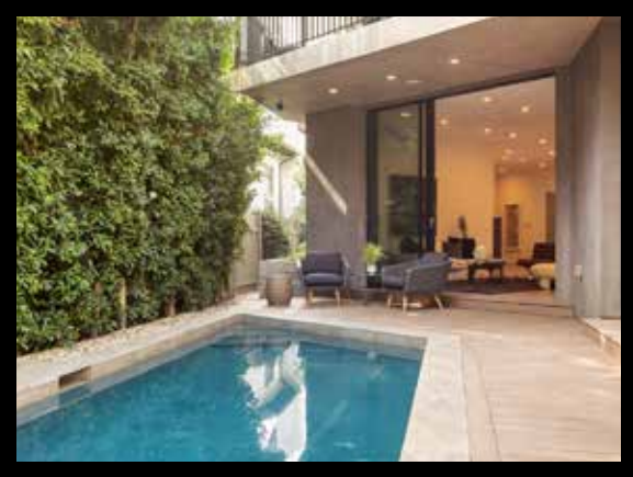
460 N Kings Rd | Beverly Grove