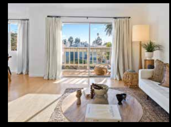
1021 12th St | Santa Monica