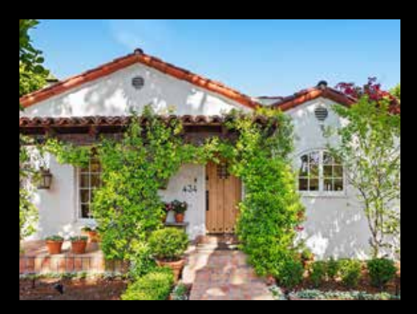
434 Westbourne Dr | West Hollywood