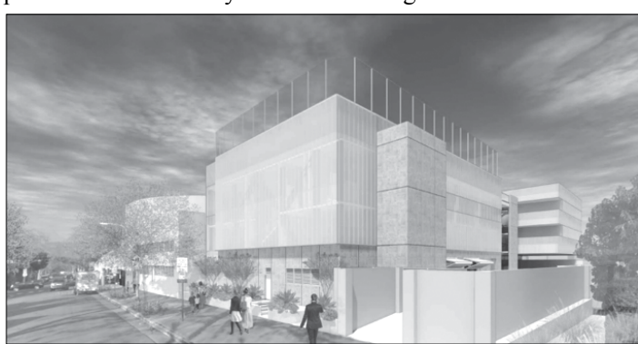
Rendition of Hillel Project

Harkham Hillel Hebrew Academy is a private school for early childhood through