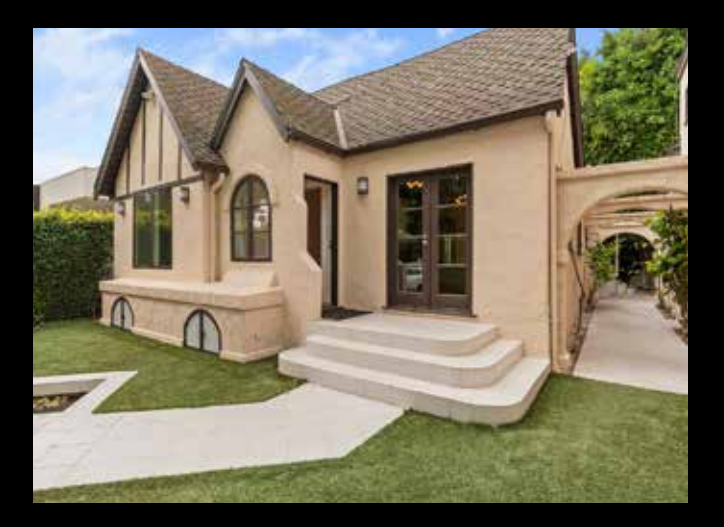
559 Huntley Dr | West Hollywood