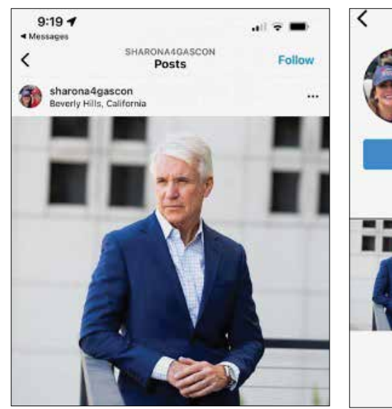
The Instagram caption read: "This man is a hero and doing wonderful things for the City of Beverly Hills and humanity!"

to one felony count of identity theft and one misdemeanor count of internet/electronic impersonation.