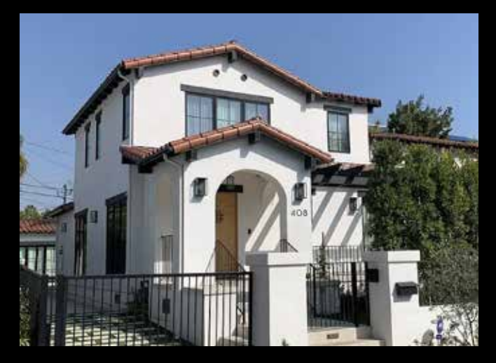
408 Westbourne Dr | West Hollywood