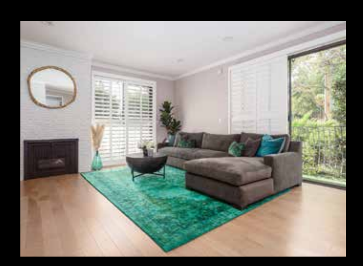
9125 Charleveille #19 | Beverly Hills