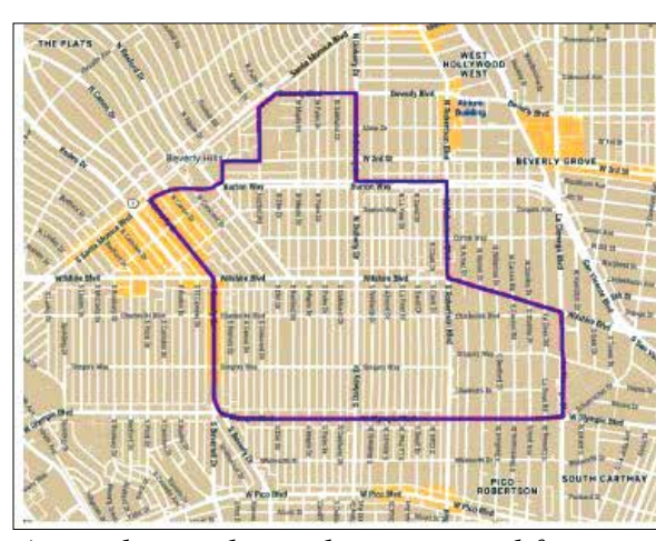
A sample circulator alignment used for rough service costing purposes

Kittelson also conducted interviews with Westside transit stakeholders, including West Hollywood and Culver City, to gather insight on local transit services,