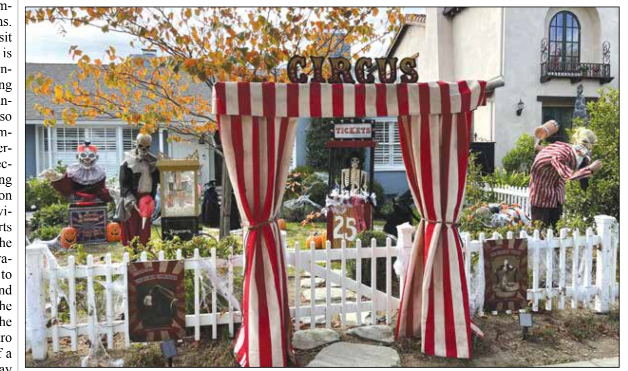
Beverly Hills Residents Getting in the Halloween Spirit

The preliminary estimated cost is estimated to be $3.5 million for a one-year pilot program with one microtransit vehi-