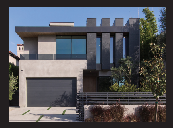
356 N Harper