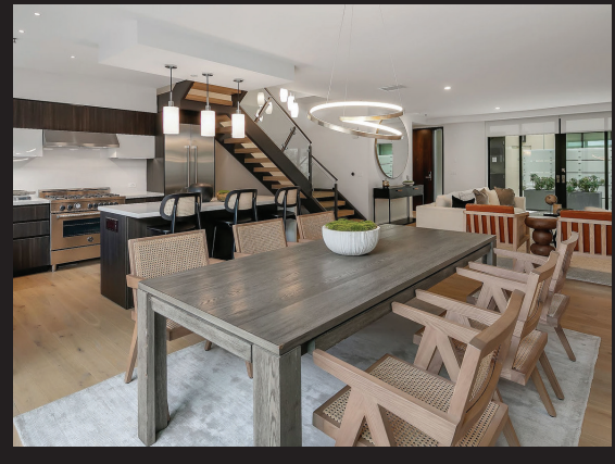
321 S Elm