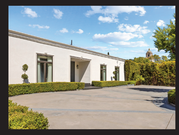
506 N Crescent