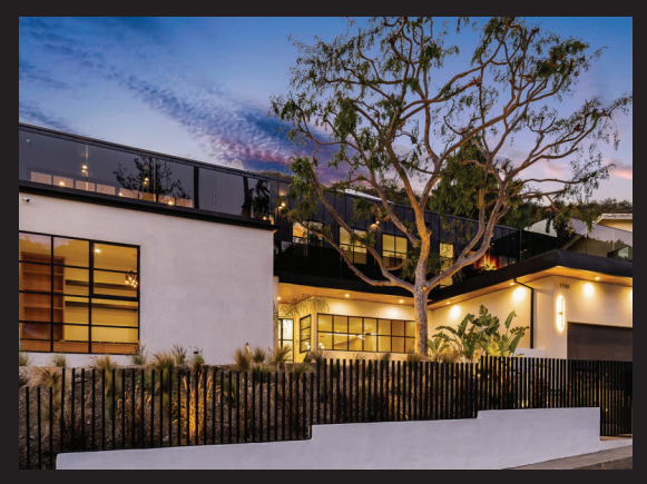
1745 San Ysidro