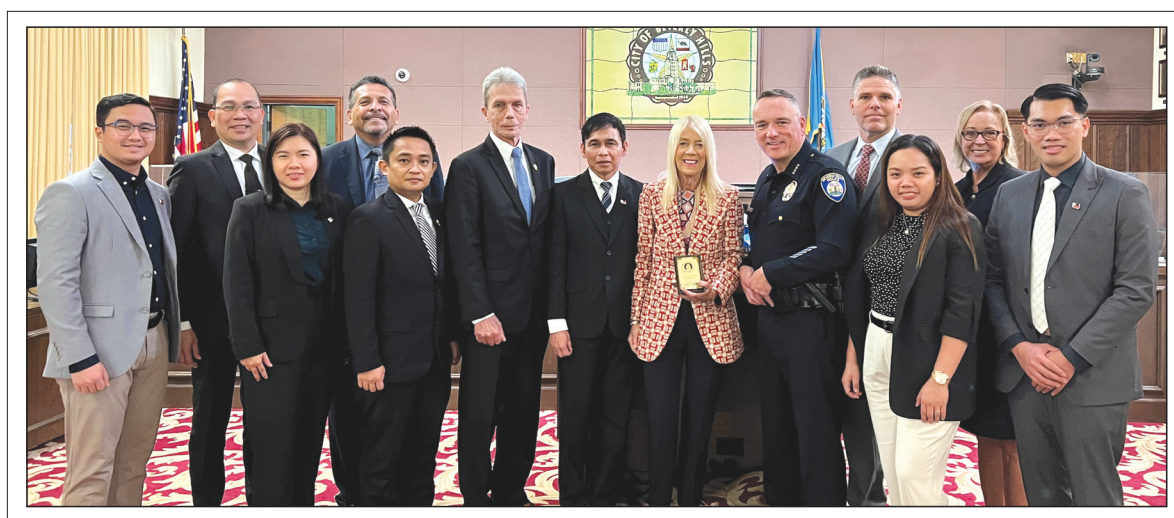
Philippine Delegation Visits Beverly Hills

The State's emergency regulation defines "Non-functional Turf" as "turf that is solely ornamental and not regularly used for human recreational purposes or for civic