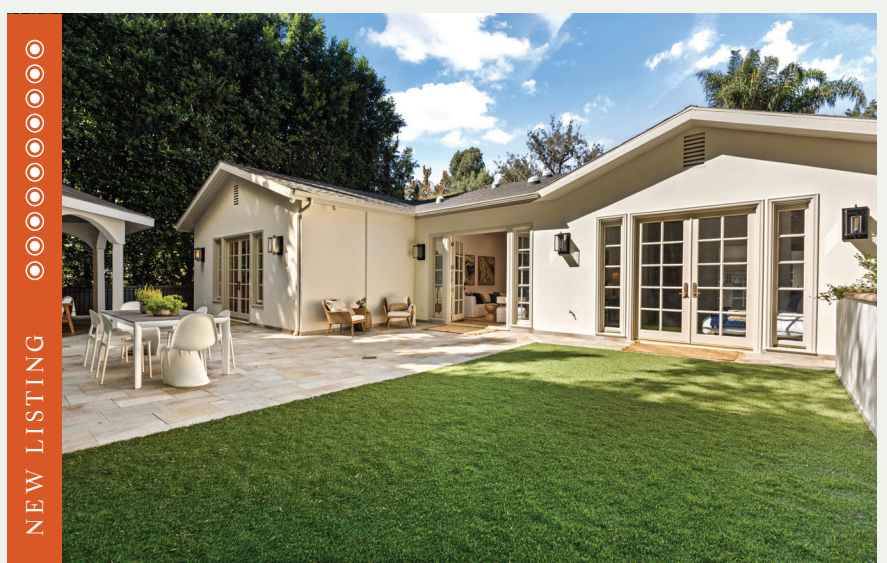
10588 LINDBROOK AVENUE | WESTWOOD Listed at $3,895,000

WANT A PROFESSIONAL EVALUATION OF YOUR PROPERTY? REACH OUT TO ME! NO COST, NO OBLIGATION.