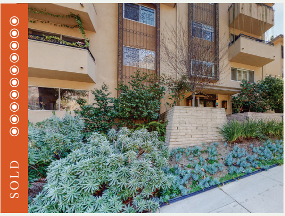
6728 HILLPARK | HOLLYWOOD HILLS Listed at $459,000 | Sold for $495,000 On the market for 129 days with previous broker