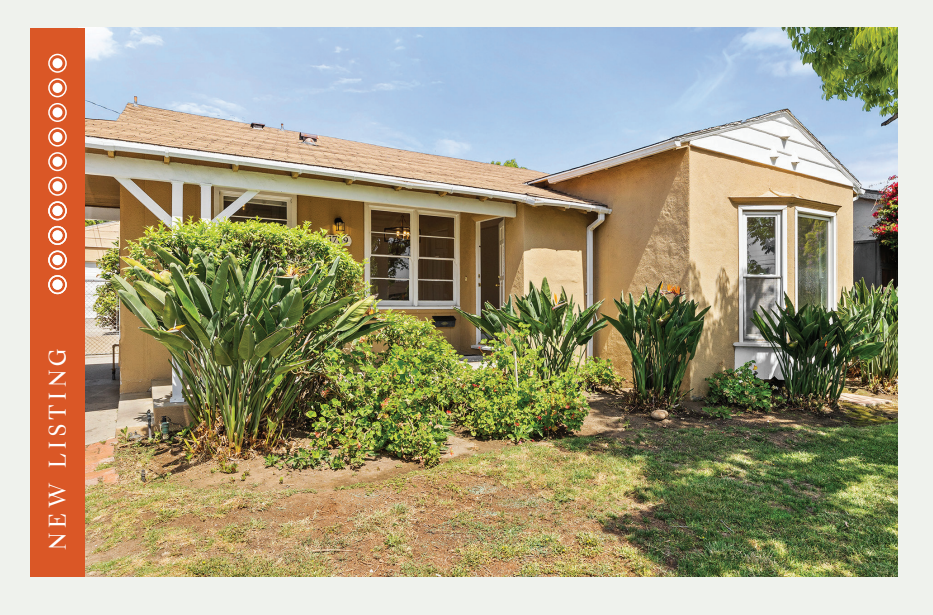
1739 PREUSS | BEVERLYWOOD Listed at $1,895,000