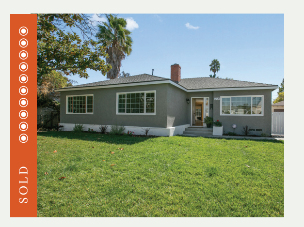
12420 ALBERS | VALLEY VILLAGE Listed at $998,000 | Sold for $1,051,000 On the market for 5 months with previous broker