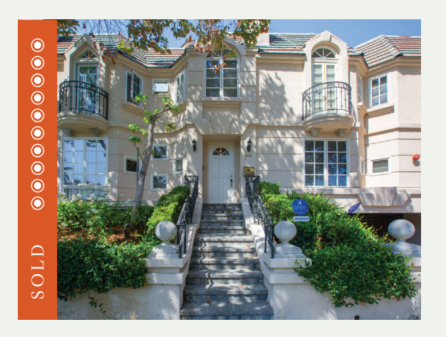
309 ALMONT | BEVERLY HILLS Listed at $1,249,000 | Sold for $1,425,000