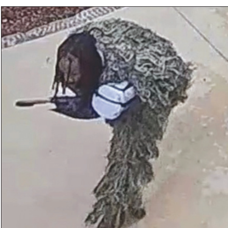
Suspect disguised as tree