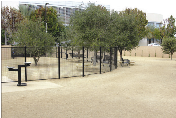
Dog Park with Decomposed Granite

sion previously discussed surface replacement for the dog park and suggested that the city engage in a community survey to determine the best way moving forward before final recommendations are made to the City Council.