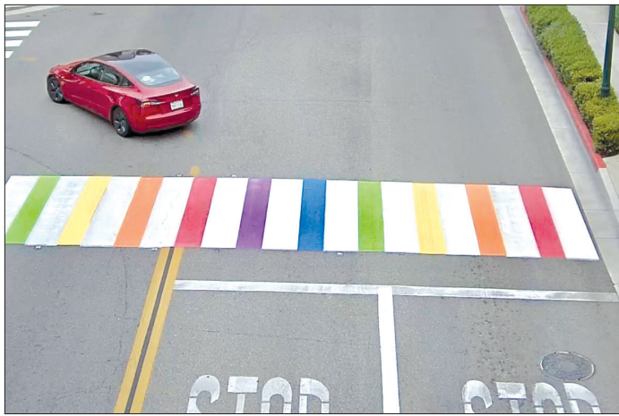
Rainbow Crosswalk on Rexford Drive

can increase drivers yielding to pedestrians.