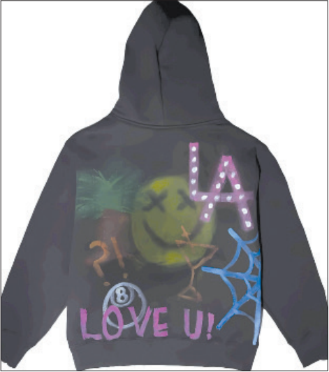
Design of Hoodie