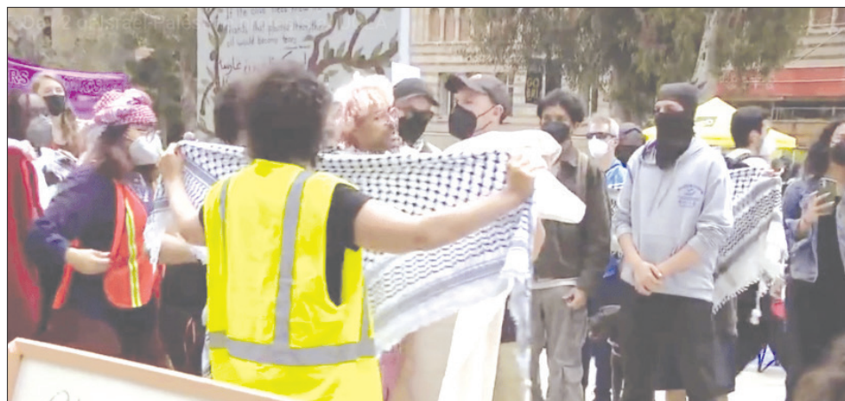
Demonstrators Holding Blankets Over Plaintiff 26.

“They held blankets and scarves over my phone to attempt to prevent me from recording. They began pushing me with open palms and with their bodies. When I tried to go around them or run away from them they followed me and kept surrounding me. They locked arms and tried to push me out of the space yelling ‘1,2,3, push!’ Over and over again while pushing me as a group. I sat down so that they couldn’t continue pushing me. They completely surrounded me with locked arms and held blankets up over me,” Jones alleges in the complaint.