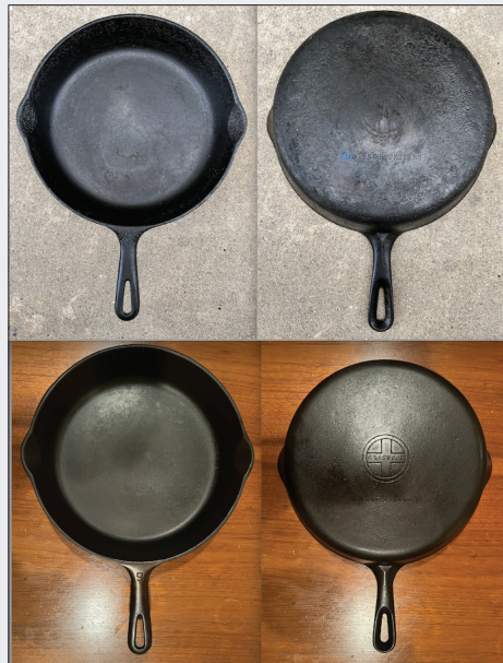
Before and After Restoration

bath, scrubbing off rust and grime, and reconditioning them with Crisco. "It's a process called the C500," he said. The skillets undergo three sessions of heating, coating with Crisco, and baking at