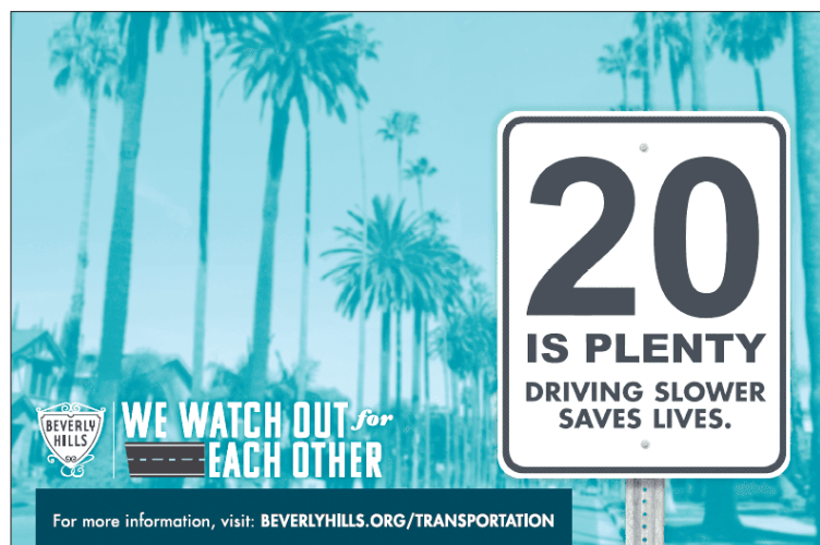
Example of '20 IS PLENTY' Sign

a 15% survival rate when hit by someone driving 40 MPH. Driving 20 MPH on residential streets will help you, your family, and neighbors stay safe," according to the campaign description.