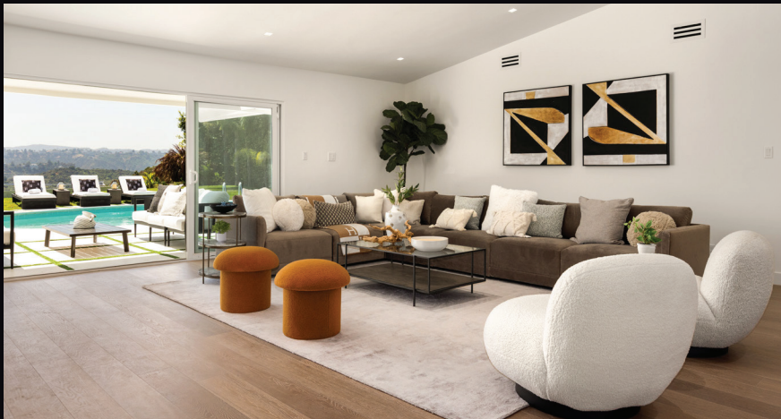
1641 Tower Grove Drive Beverly Hills, CA 90210