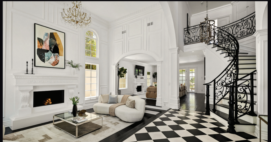
509 Westmount Drive Los Angeles, CA 90048