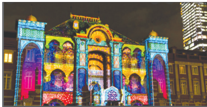
November 14, from 5 p.m. to 8 p.m. on Rodeo Drive.

Throughout the event, attendees can view a variety of performances, includ-