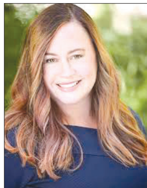
Shelby Van Pelt

luminous debut novel about a widow’s unlikely friendship with a giant Pacific octopus reluctantly residing at the local aquarium—and the truths she finally uncovers about her son’s disappearance 30 years ago,” according to the library description. “After Tova Sullivan’s husband died, she began working the