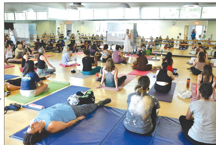
Yoga Class at Last Year’s Event

September 22, from 10am to 2pm at Roxbury Park & Community Center and will focus on wellness, community, and mental health, and it’s free for the public. Attendees can expect information-