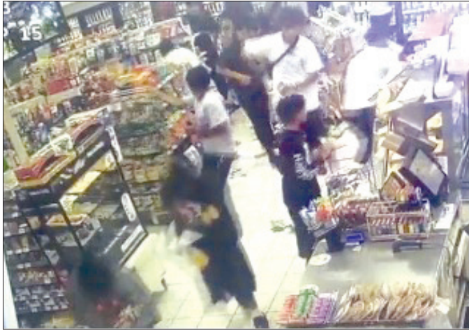
Dozens of Teens Trash Convenience Store

Video surveillance footage shows the teens throwing items and pushing shelves to the floor, while some climbed on counters.