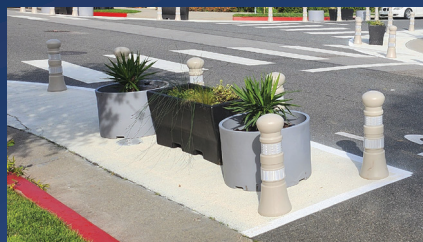
Example Curb Extensions

Take the community survey about your experiences and observations by October 1, 2024. For questions, contact askBH at (310) 285-1000 or askBH@beverlyhills.org.