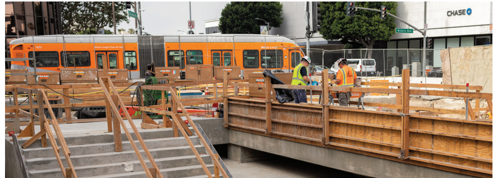
D LINE SUBWAY EXTENSION PROJECT Section 1 – Beverly Hills

The rejected proposal submitted by developer Leo Pustilnikov exceeds density and height zoning limits. But the applicant believed the project "maintains vested