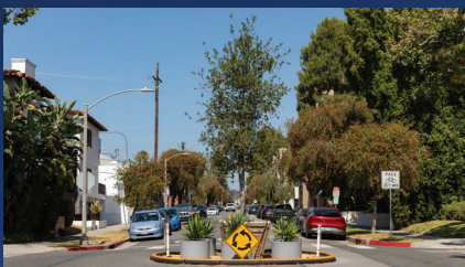
Example Traffic Circle

Clifton/Hamel Clifton/Willaman Clifton/Carson Clifton/Stanley