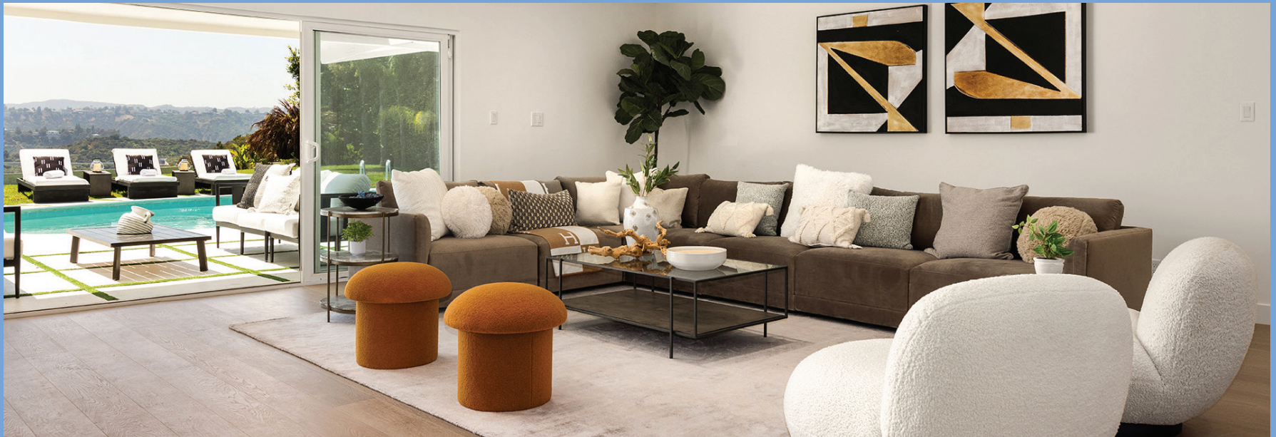
1641 Tower Grove, Beverly Hills