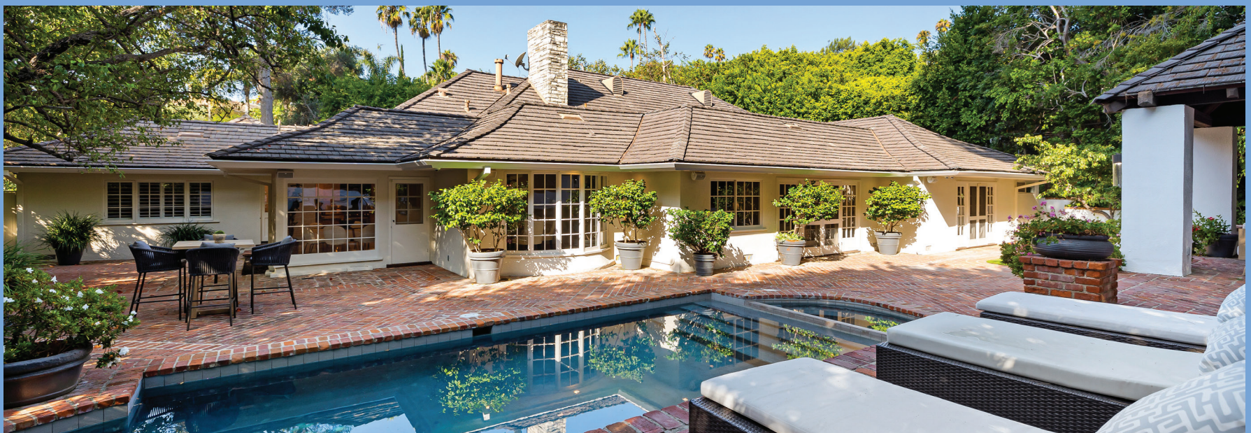
1124 North Laurel Way, Beverly Hills