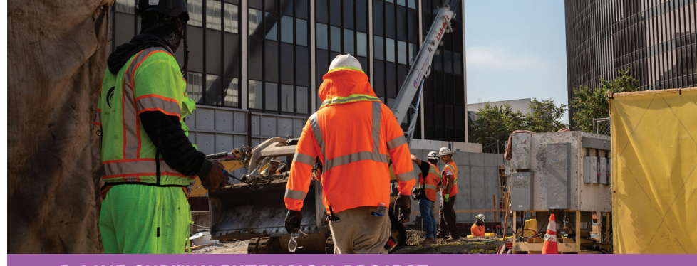
D LINE SUBWAY EXTENSION PROJECT

Case Number: 24NWCP00385 SUPERIOR COURT OF CALIFORNIA, COUNTY OF LOS ANGELES 12720 Norwalk BI