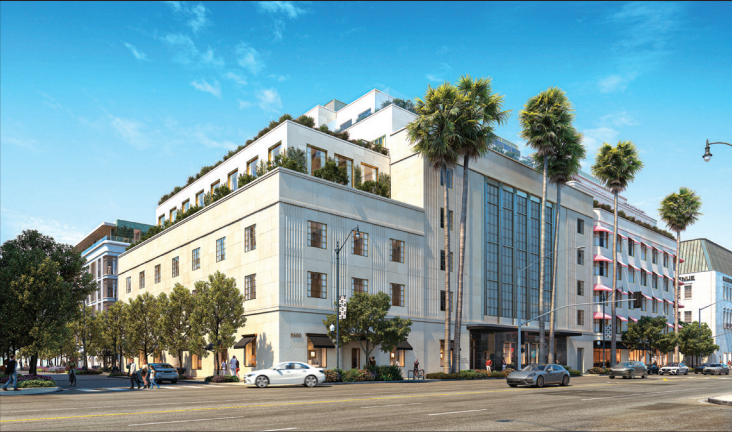
Updated Rendering of 9600 Wilshire