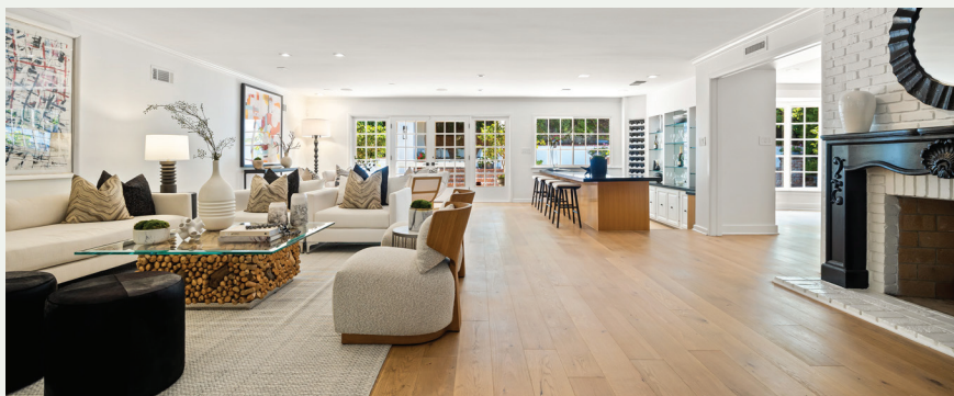
1124 N Laurel Way, Beverly Hills