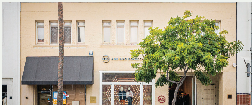
329 N Beverly Drive