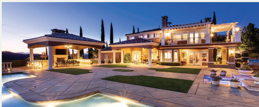
8345 Overview Court, Yucaipa