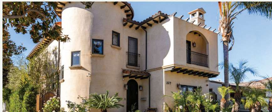
227 S Carson Road, Beverly Hills