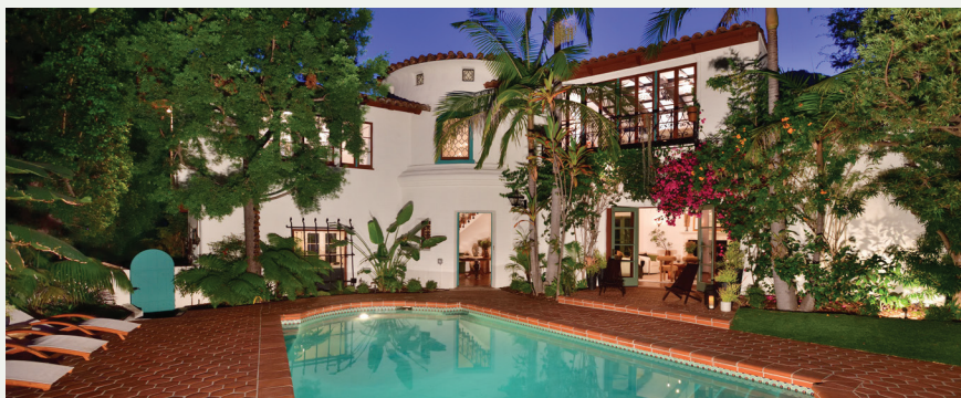
1919 Outpost Drive, Los Angeles