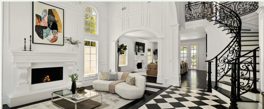
509 Westmount Drive, West Hollywood