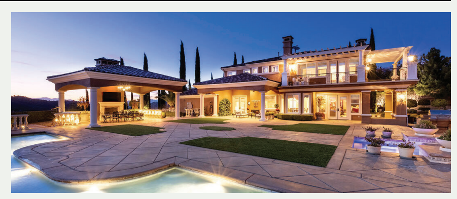
8345 Overview Court, Yucaipa