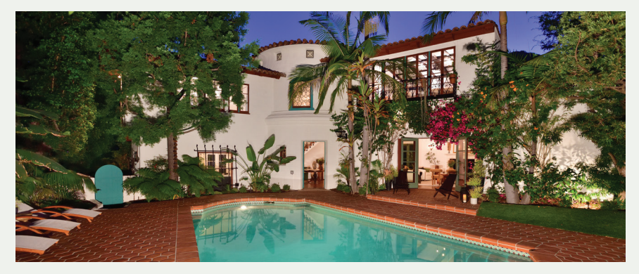
1919 Outpost Drive, Los Angeles