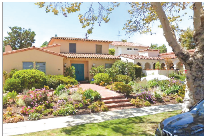
Garden in Central Area Using California-friendly plants

676, effective in 2024, restored local authority to regulate or ban synthetic turf installations. Previously, state laws limited municipal oversight to encourage water conservation during California's severe droughts.