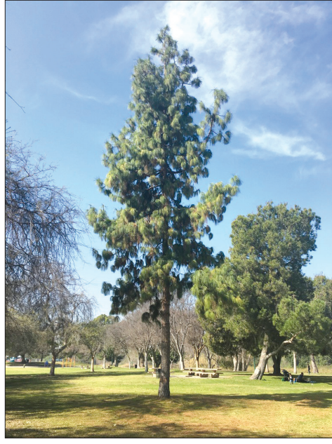
Canary Island Pine Tree

Historical records indicate that the number of Coldwater Canyon pines has been steadily decreasing. Of the origi-