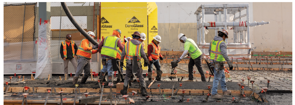
D LINE SUBWAY EXTENSION PROJECT Section 1 - Beverly Hills

ESHAGIAN, NADER, 65, arrested on 3/18/2025 for resisting, delaying or obstructing any public officer, peace officer, or emergency medical technician, domestic assault - inflicting corporal injury (spouse or cohabitant abuse).