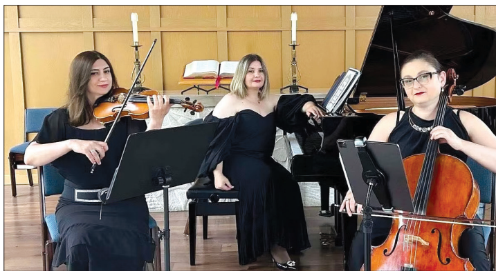
Shell Piano Trio

Buchenwald concentration camp and Armenian Genocide Remembrance Day. Formed in Yerevan, Armenia, in