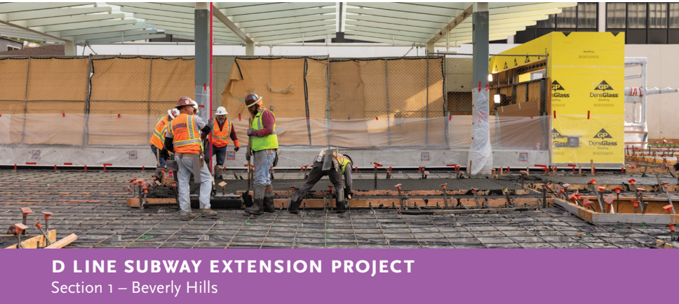
D LINE SUBWAY EXTENSION PROJECT Section 1 – Beverly Hills