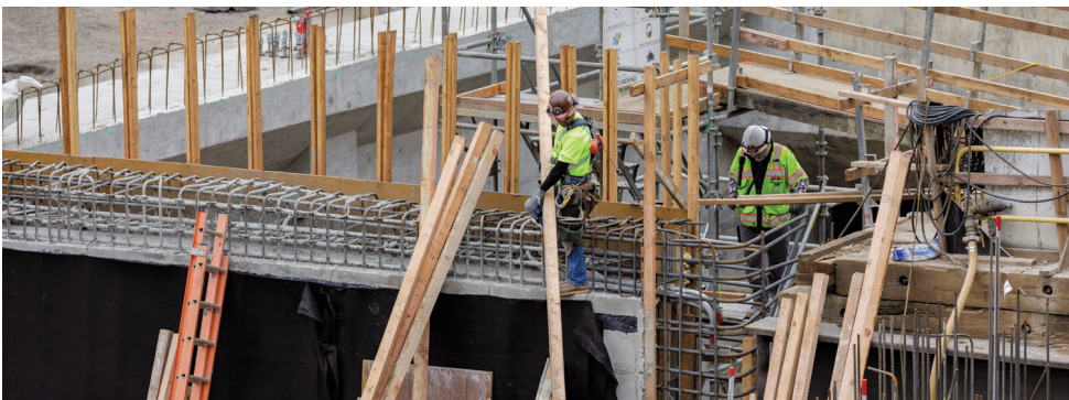
D LINE SUBWAY EXTENSION PROJECT Section 2 – Beverly Hills