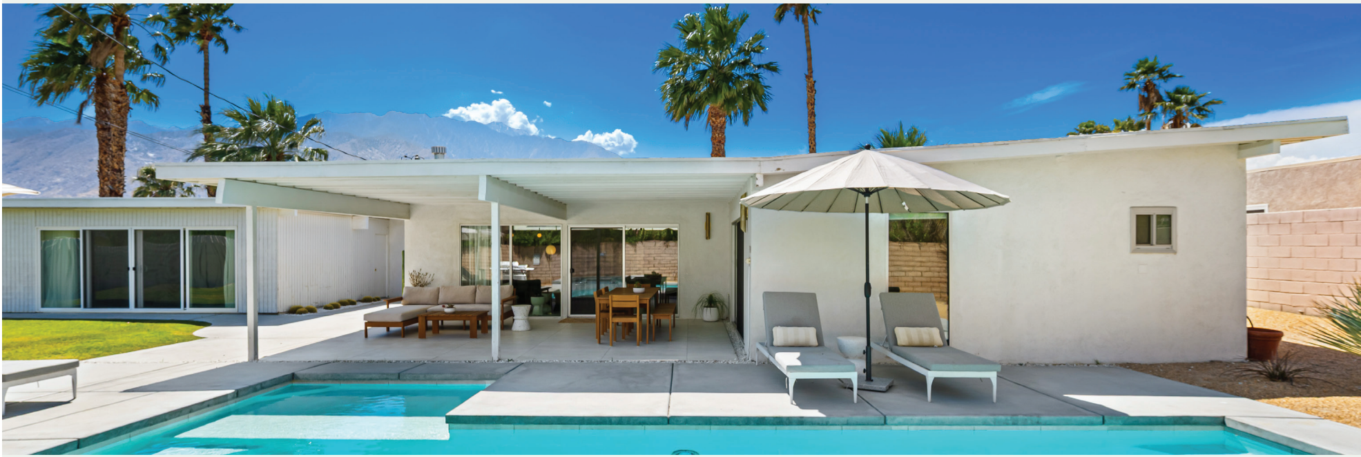
3841 East Camino Parocela