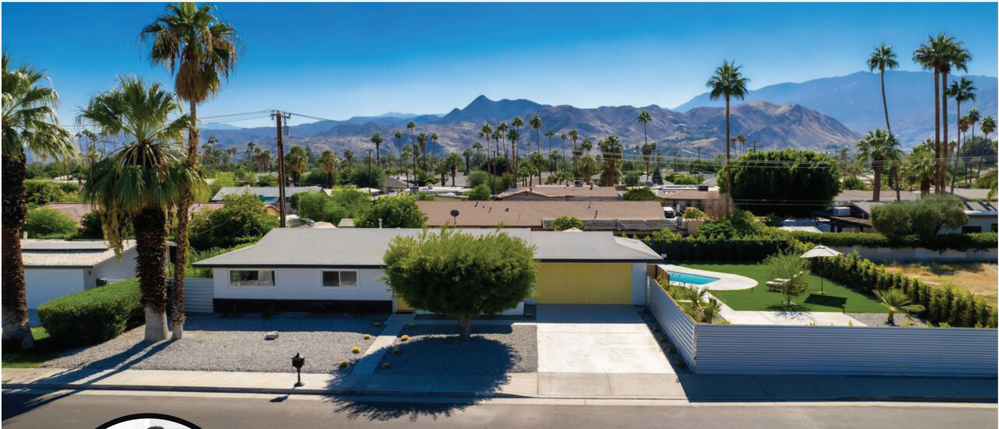
2900 N Chuperosa