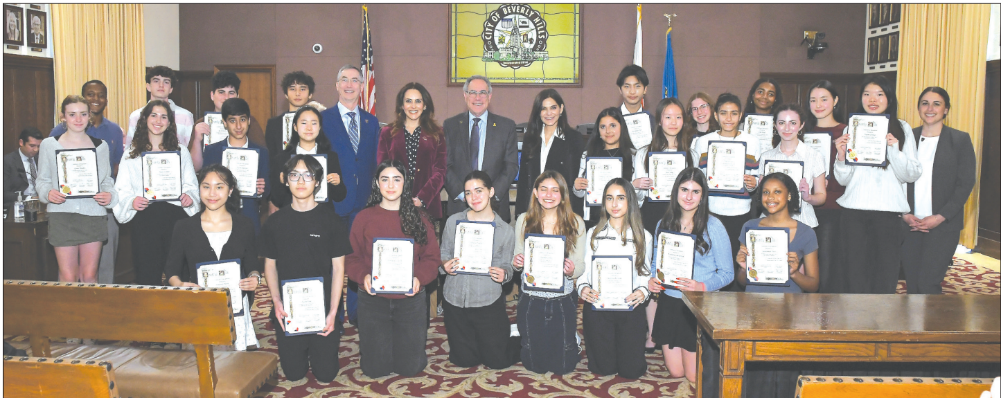
City Council Honors Teen Advisory Committee Last week, the City Council honored the Teen Advisory Committee Class of 2024-2025.

was the smallest at 6,709 square feet. A sound study was also conducted to assess potential noise impacts on nearby residences and neighboring courts. According to the study, converting courts 7, 8, and 12 to pickleball would not result in a significant noise impact to residents. A second configuration—converting courts 7, 11, and 12—would produce slightly more audible noise for nearby residents but still fall within acceptable thresholds, according to the staff report. However, that configuration was found to generate a more intense sound impact on adjacent tennis courts, particularly because it would move pickleball activity closer to courts 10 and 15 and surround court 8. This item will be presented to the City Council at a future meeting.