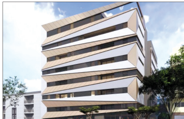
Proposed Rendering (Beverly Hills View)

The City Council has rescheduled a public hearing for August 5 to consider an appeal of the housing project at 412 North Oakhurst Drive. The hearing was postponed after the appellant appeared physically unwell during Tuesday’s meeting and steadied himself against the wall. The delay also allows time for