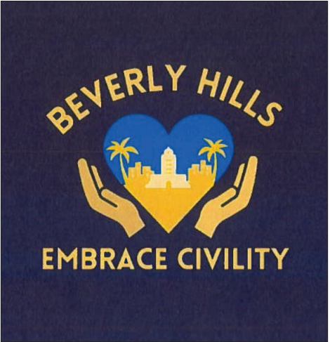
Example of Redesign

February meeting, where members discussed incorporating a graphic of Beverly Hills City Hall into each version. Based on this feedback, designers updated the logos with refinements presented during the March 20, meeting. These revisions included the addition of a City Hall illustration and adjustments