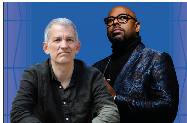
Christian McBride and Brad Mehldau

The Wallis will host a performance featuring bassist Christian McBride and