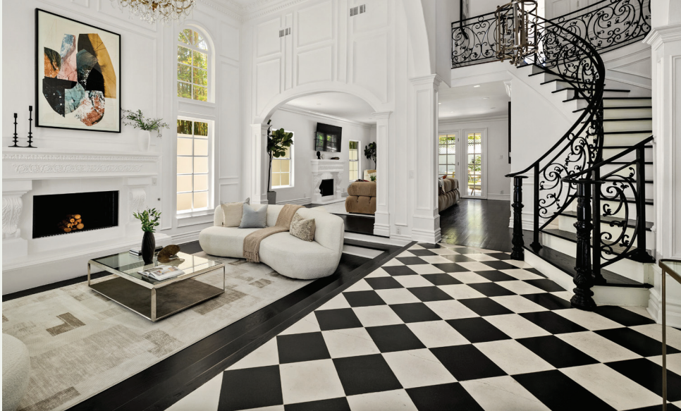
509 Westmount, West Hollywood Sold for $4,190,000