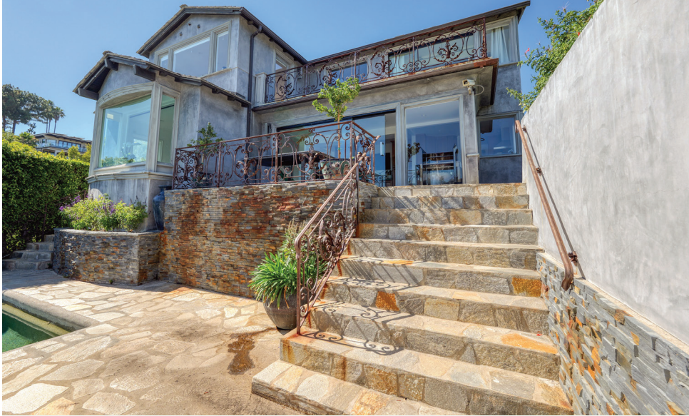
1300 Summitridge, Beverly Hills Available for $15,000/month