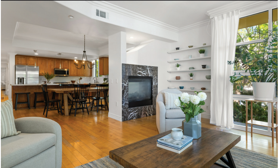
1601 S Bentley, Unit #201 Available for $1,499,000