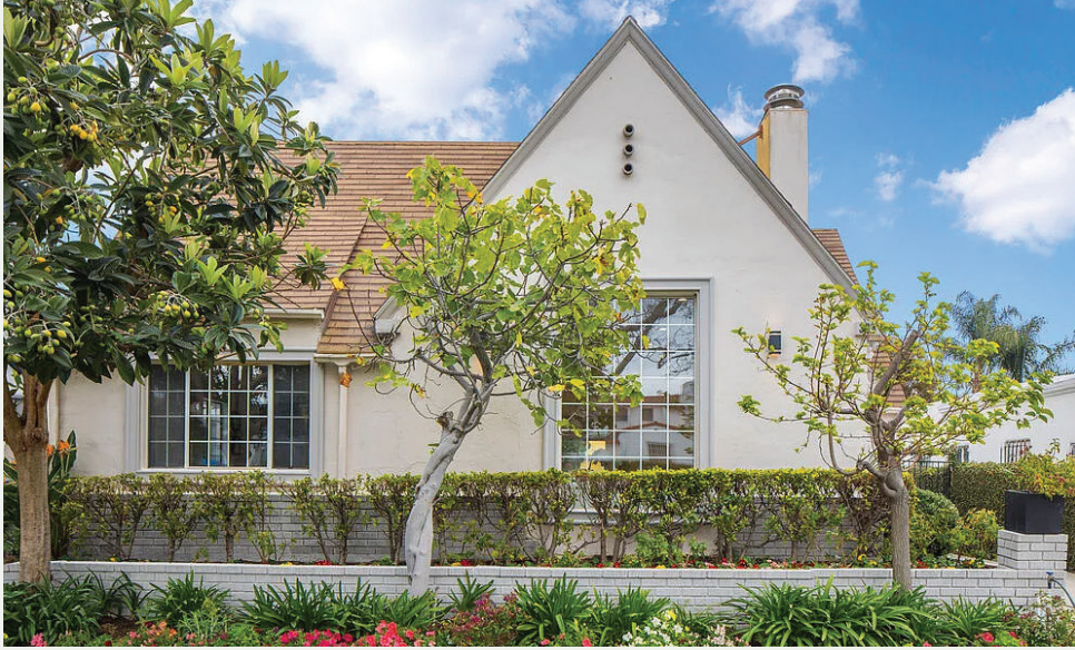
324 S Canon Drive, Beverly Hills Sold for $3,500,000